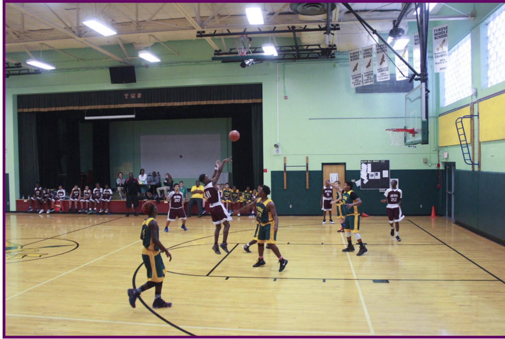
Boys Basketball Team won the 2016-2017 South County Division Championship. They won 9 out of 10 games.